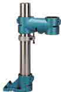
Base Support FS-52BS